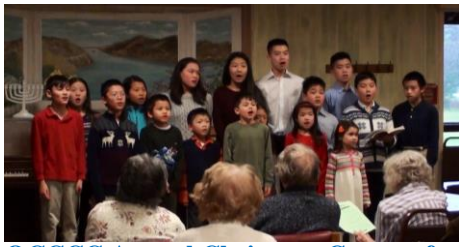
OCCCC Annual Christmas Concert for Sr. Citizens at Country Inn, New Windsor, NY 23-Dec-2015