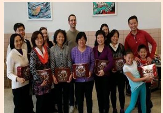
OCCS Faculty and Staff Celebrated Holidays on 12-Dec-2015

classtools.net/connectfours (声调练习) mypinterst.com showmeclip.com 《书法》app kahoot.it (史秀全)